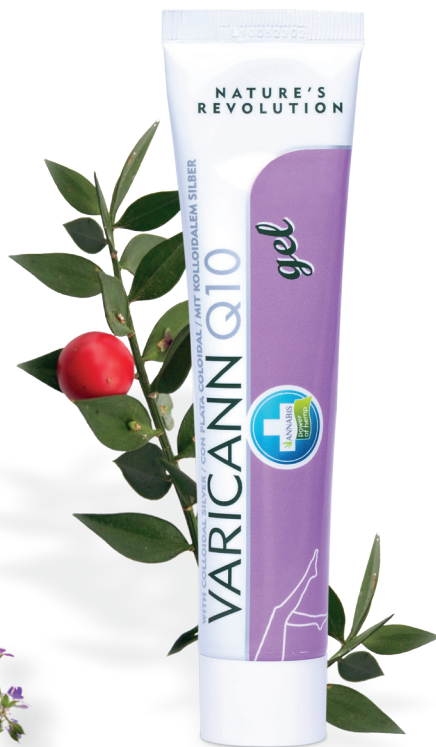
packaging: 75 ml