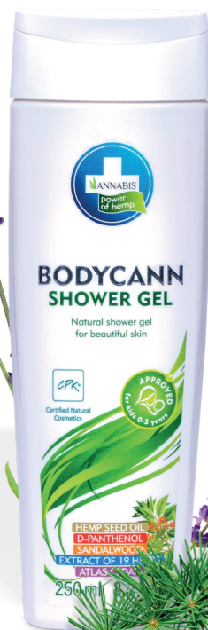
packaging: 250 ml